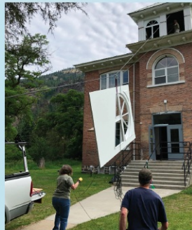
...we helped restore the bell tower on the Paradise School in Sanders County.