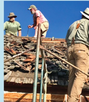
...we provided funding to replace the roof on Montana's oldest building (1847) at Fort Connah near St. Ignatius.