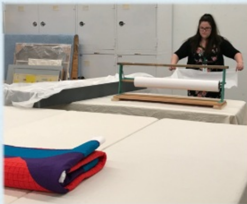
Photo right: during the cataloguing process, Museum of the Rockies staff improved the storage conditions of their historic quilt collection by reducing the number of quilts in each archival box, re-folding and boxing the quilts, and labeling the boxes with images to create easier access.

At left is one of the oldest quilts in the collection: Slashed Star , circa 1870. It traveled to Montana with a Civil War prisoner of war veteran, who came to Montana to homestead in Broadwater County in 1898.